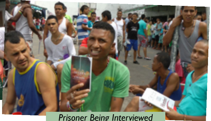
Prisoner Being Interviewed