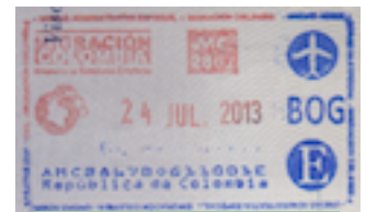
Barb's Exit Stamp